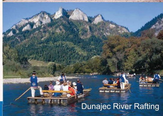
Dunajec River Rafting