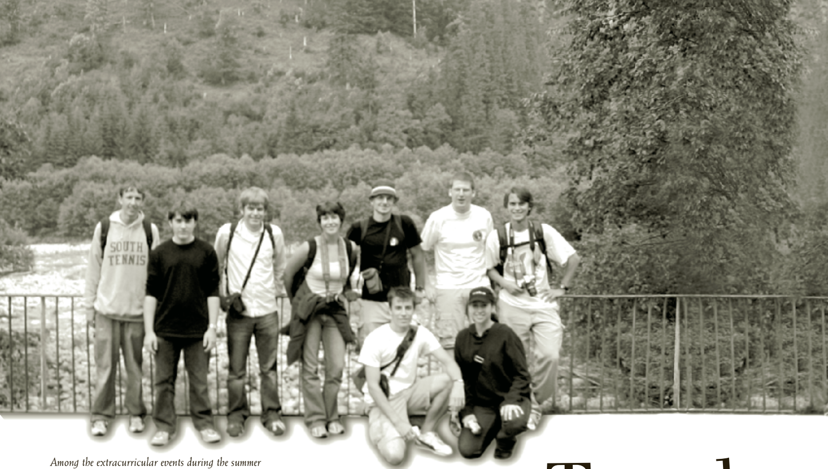
Among the extracurricular events during the summer sessions was a trip to Zakopane and the beautiful Tatra Mountains.