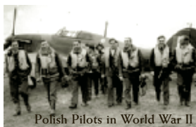
Sharing Stories: Polish Life in Our Valley

The Annual meeting of the Chapter is planned for November 21, 2004, to take place at the Polish Consulate RP in Chicago. The meeting will follow a concert by a past winner of the Chopin Piano Competition.