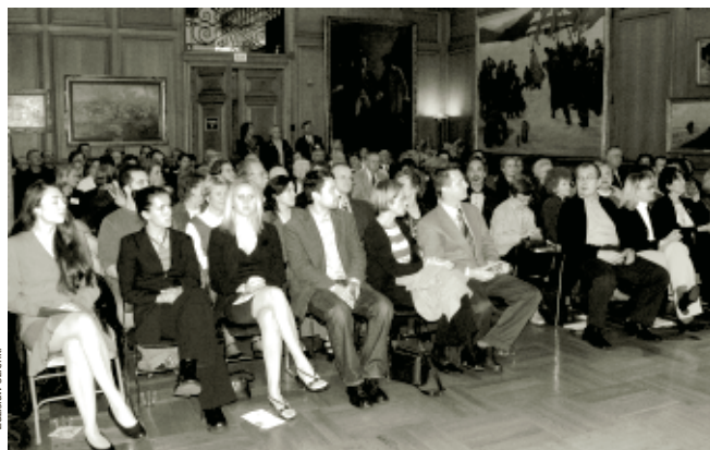
Scholarship and grant recipients were honored at Members Day 2004.