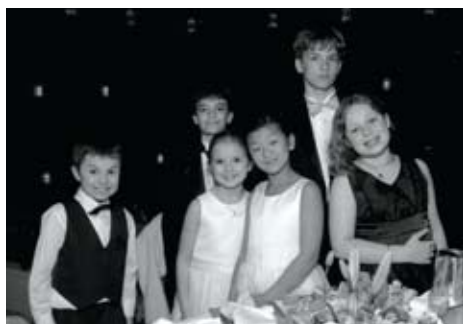
Just a few of the many children at this year's ball strike a pose for the camera.