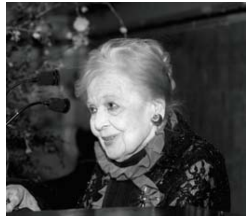
Mme Eggerth entertained the guests at the Ball with anecdotes from her long career and a few bars of song.

causing a sensation and thrilling audiences wherever they appeared. As a singing team they were perfectly matched, performing together on the operatic stage to rave reviews. In 1943, they starred together on Broadway in a production of Lehár’s The Merry Widow , with Robert Stolz conducting and George Balanchine as choreographer, a work they would eventually perform more than 2,000 times, in five languages throughout America and Europe. Marta Eggerth would become perhaps the most famous “Widow” of all time.