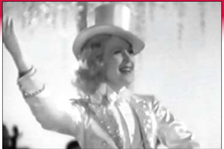
Mme Marta Eggerth in the 1930s

It was on the set of the 1934 film Mein Herz ruft nach dir (My Heart is Calling You) that she met and fell in love with the dashing young Polish tenor, Jan Kiepura. They were married in 1936 and together became known as Europe’s Liebepaar (Love Pair)