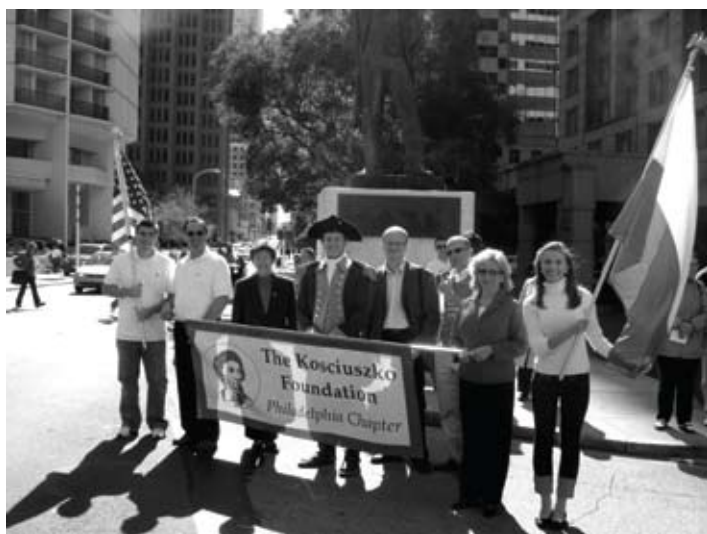
PHILADELPHIA PULASKI DAY PARADE: The Kosciuszko Foundation's Philadelphia Chapter marched in Philadelphia's Pulaski Day Parade with pride back in October.