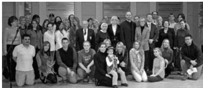
Attendees at the February 25, 2008 concert.

The concert was also sponsored by the Northeastern Illinois University and the Council of Educators in Polonia.