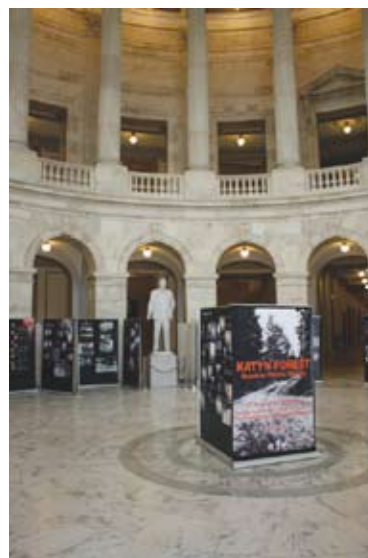
Katyn exhibit at the Library of Congress

Perhaps the most talked about event that the Kosciuszko Foundation held in Washington was the Katyn conference in April at the Library of Congress. As this year marked the 70th anniversary of the Katyn murders, in February the Foundation