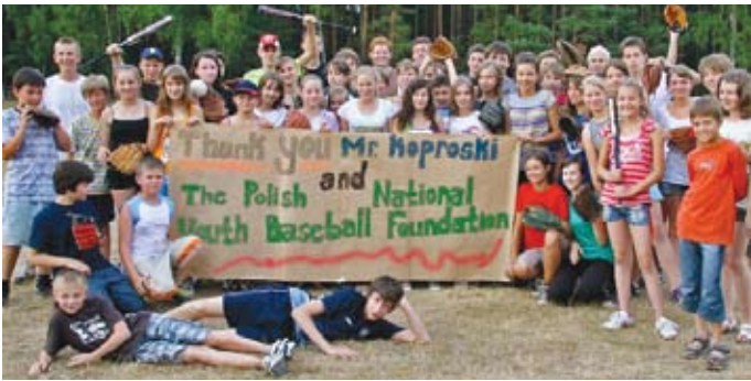
Thank You once again from the students and staff from the Kosciuszko Foundation Arts Enriched English Camp, Zalecze, Poland 2010