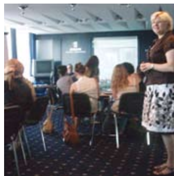
Philadelphia Chapter President at Krakow Workshop

described as the “female incarnation of Liszt,” likewise thrilled the audience with her outstanding accompaniment. Before and after the concert, guests bid on Silent Auction items and enjoyed refreshments and Polish pastries.