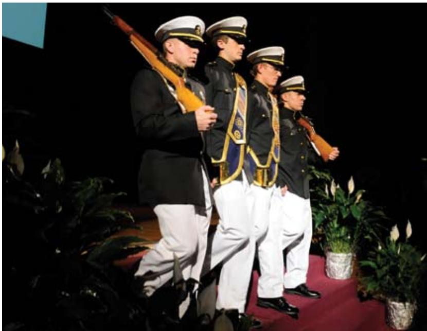
Midshipmen from the Kings Point Merchant Marine Academy