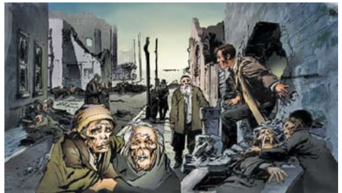
"Messenger from Hell" at the Kosciuszko Foundation, animated short film about Jan Karski, the man who tried to stop the Holocaust.