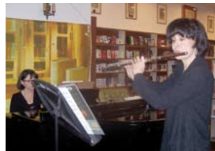
An afternoon of poetry and music