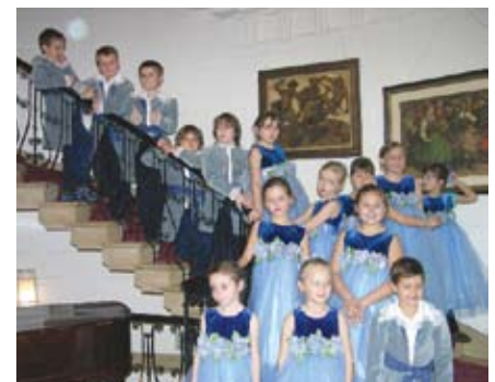
Polish American Folk Dance Company Kids