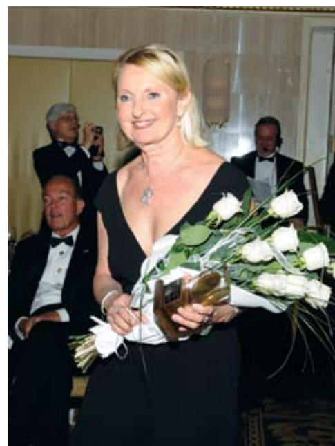
Maria Siemionow, Pioneering Plastic Surgeon, Medal of Recognition Awardee