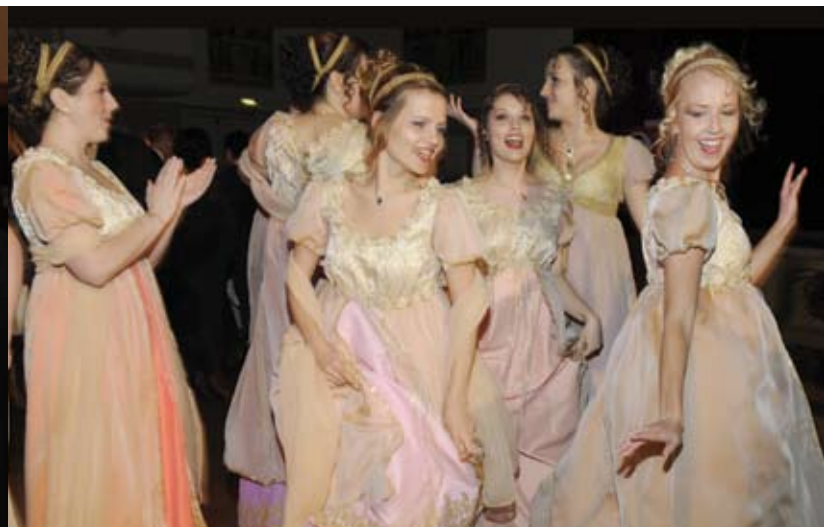
The Polish American Folk Dance Company