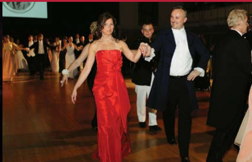
Guests enjoying the traditional polonaise dance